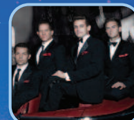
THE MIDTOWN MEN Four Stars from the original cast of JERSEY BOYS Aug. 31 & Sept. 1