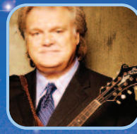
RICKY SKAGGS Aug. 27 & 28