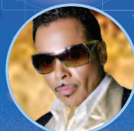
MORRIS DAY & THE TIME Aug. 25 & 26

BANDSHELL TONIGHT AT THE LEINIE LODGE BANDSHELL! CITY PAGES