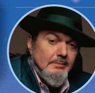
DR. JOHN & THE LOWER 911 Sept. 2 & 3