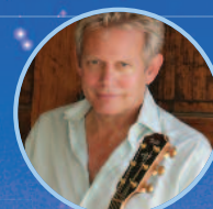
DON FELDER, formerly of The Eagles Aug. 29 & 30