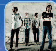
TAPES 'N TAPES Sept. 4 & 5