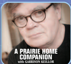
A PRAIRIE HOME COMPANION with GARRISON KEILLOR