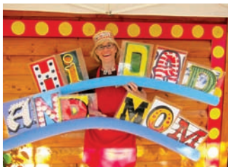
Play with the Fair Letters at the Photo Booth. It’s free!